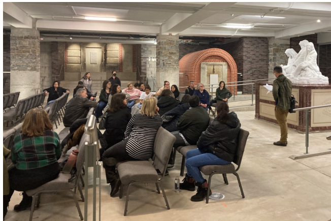
Loretto College School staff at tour conclusion in crypt at St Michael's Cathedral

The Loretto Archives is pleased to have concluded our contributions to the 175th Anniversary Celebrations in September. We had 4 groups of people from all walks of life come together and participate on the Walking Tour to celebrate and educate participants on the conditions and social climate that the First Five Loretto Sisters who came to Canada would have arrived in. The last group of the walking tours happened at the start of November and was attended by the teachers of Loretto College School. We hope that everyone who went on the tour got a taste of the rich history of the Irish community in Toronto and got a sense of the challenges our First Five Sisters took in hand.