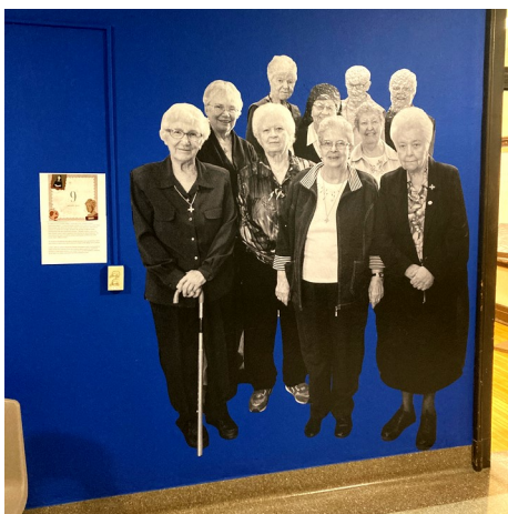
Legacy wall at Loretto Abbey

In September we were asked to once again put on a display of Archival Holdings at Loretto Abbey during their grade 8 open house. We put out a number of items ranging from old vinyl records of school concerts to old uniforms (always very popular with the young prospective students, in particular the light blue blazer that Abbey students wore at one time). While at this open house we caught our first glimpse of the Legacy Wall that the Abbey had put up in their main floor hallway with a large picture of some of our Sisters.