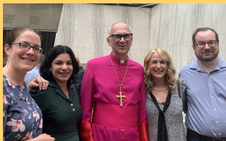
Bishop's Installation with Archivists