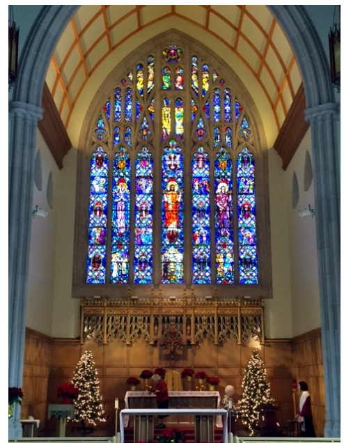
Christmastime at Loretto Abbey chapel

In a way, the Daily TV Mass contributes to the preservation of the history of Loretto Abbey and the legacy of Loretto's educational work in Canada as a significant contribution to the teaching and pastoral ministry of the Church. It is certainly a blessing appreciated by the huge "Daily TV Mass Community".