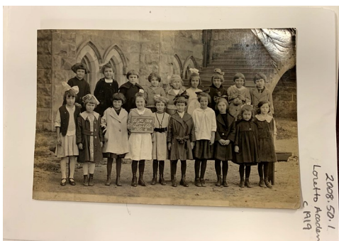
Guelph students 1919

The traveling banner display to celebrate 175 years of the Institute in Canada continues its trip around to different affiliated schools having recently made its way from Guelph to the Niagara region schools.